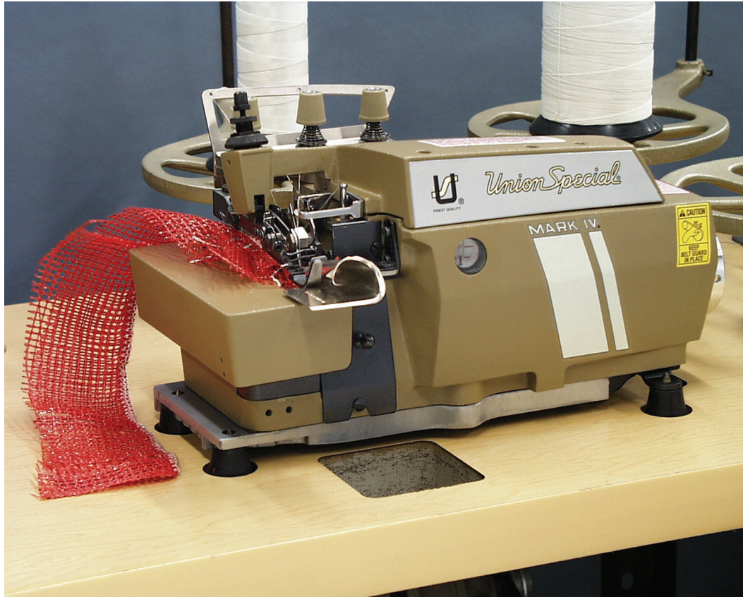
39500TYA with Sewing Table UH239G130