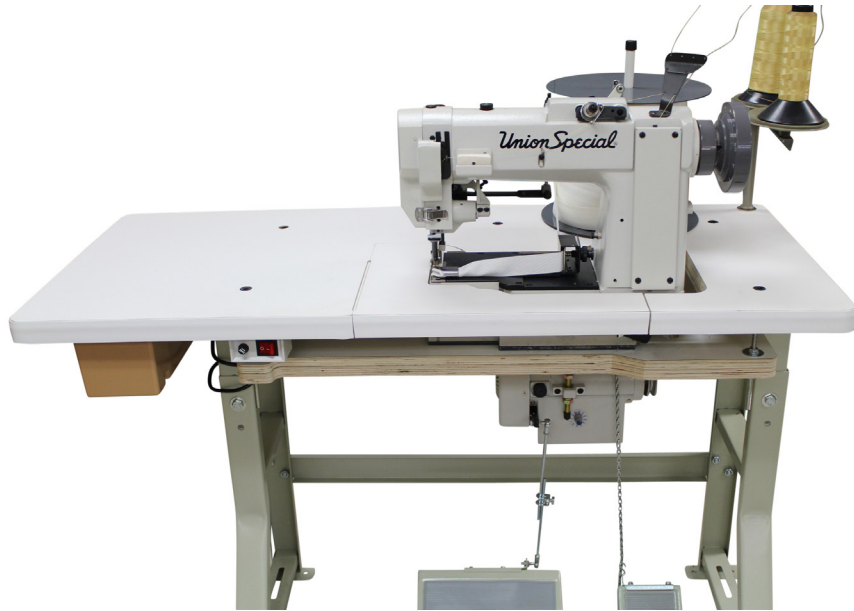
Single Needle, Double Locked Chainstitch Machine with Compound feed and tape binder