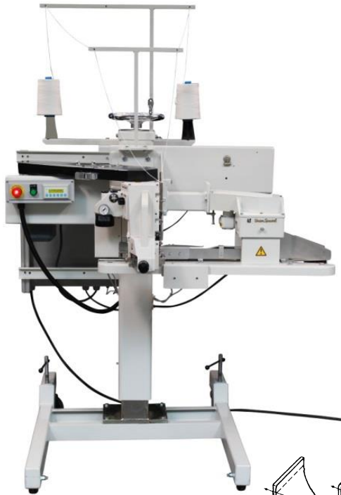
Plain Sew or with Foldover

HIGH SPEED AUTOMATIC SEWING SYSTEMS FOR PLAIN OR TAPE SEW APPLICATIONS.