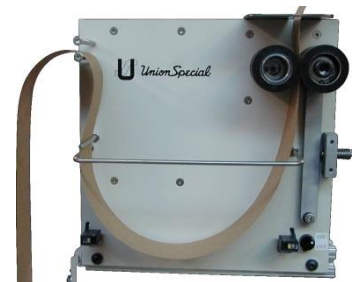
Tape Feeder Option