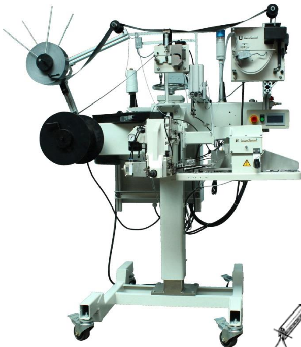
Easy-Open Pull Tape