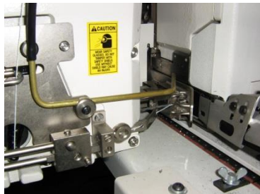
Needle Cooler Option